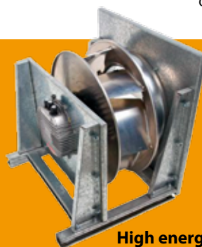
High energy efficiency EC plug fan.