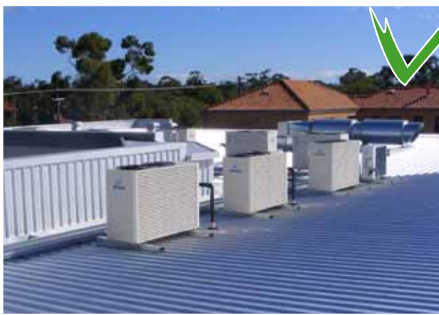
The Wembley Green ActronAir installation

As a result the choice fell on compact ActronAir air conditioners which because of their shape and size are not visible from the street and also don't require strapping against the wind.