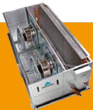
Low profile evap

*MEPS 2010 and MEPS 2011, QLD Development Code MP4.1, SA Energy Performance Standards.